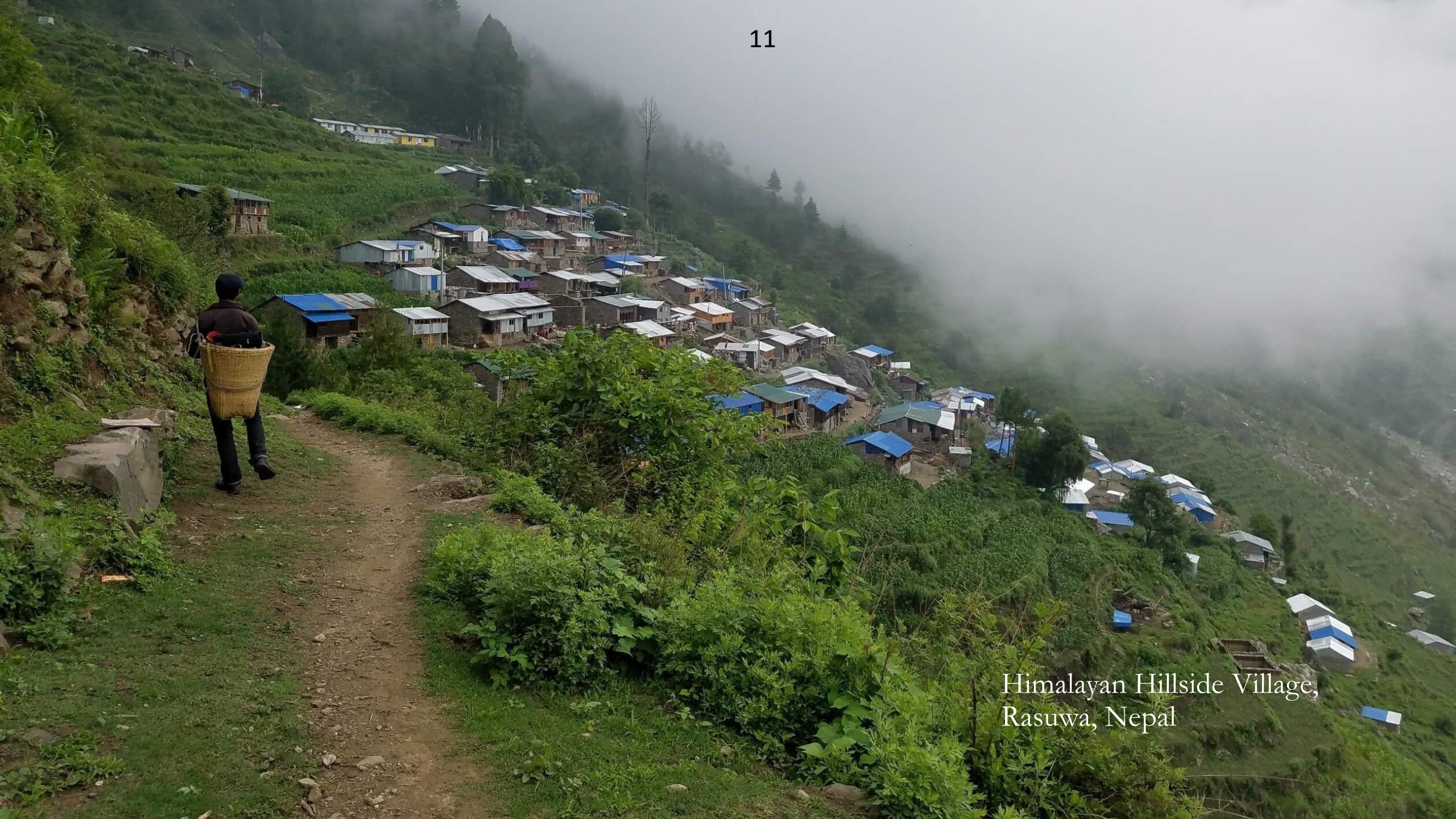
Himalayan Hillside Village, Rasuwa, Nepal