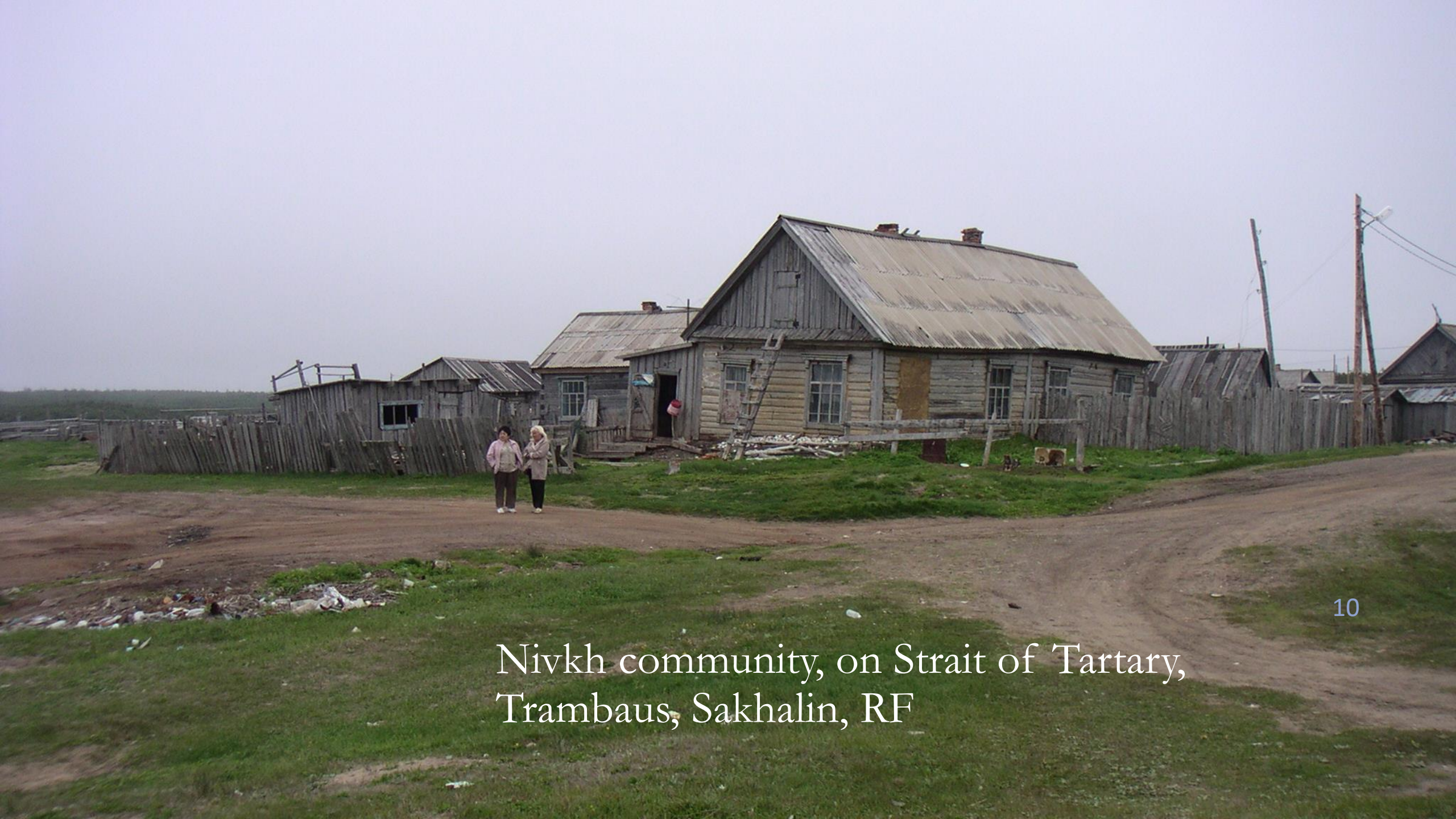
Nivkh community, on Strait of Tartary, Tramhaus, Sakhalin, RF